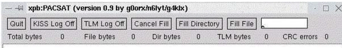
Figure 3. Original xpb.

Finally we can show the original xpb and the modified xpb